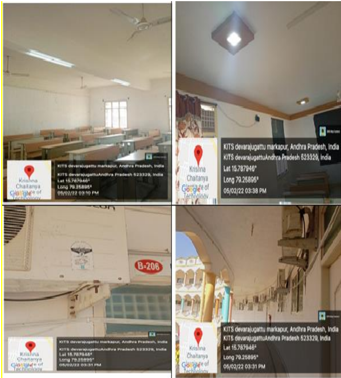
Figure 6: LED bulbs and energy star rated equipment

PRINCIPAL KRISHNA CHAITANYA INSTITUTE OF TECHNOLOGY & SCIENCES Devarajugattu (Village) Peddaraveedu Mdl, Prakasam Dt, A.P.