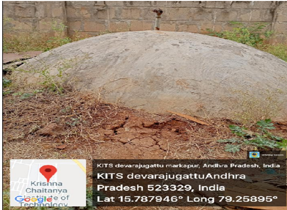
Figurer2 Gober gas plant