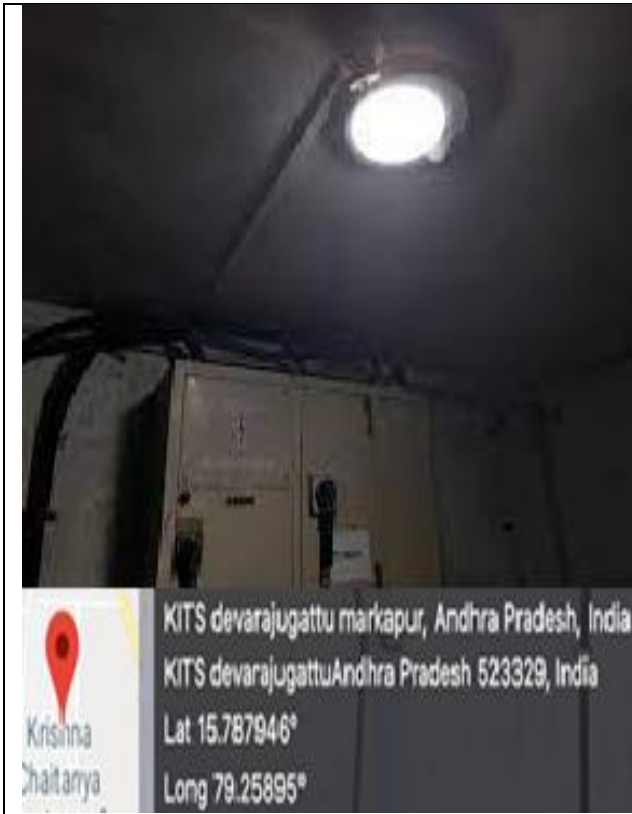
Figure 5 Sensor lights at entrance