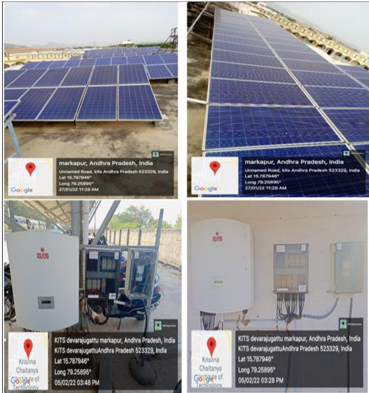
Figure 1 Roof top Solar panels, Inverters and power supply in the campus

PRINCIPAL KRISHNA CHAITANYA INSTITUTE OF TECHNOLOGY & SCIENCES Devarajugattu (Village) Peddaraveedu Mdl, Prakasam Dt, A.P.