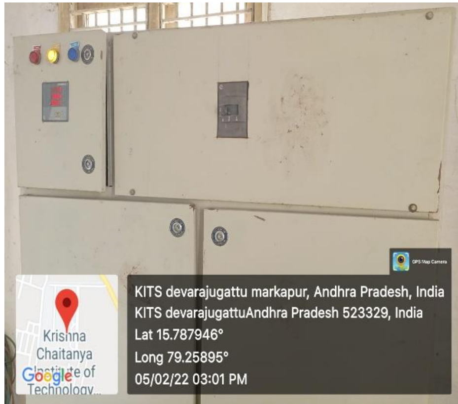
Figure 7 Sensor based Starter

PRINCIPAL KRISHNA CHAITANYA INSTITUTE OF TECHNOLOGY & SCIENCES Devarajugattu (Village) Peddaraveedu Mdl, Prakasam Dt, A.P.