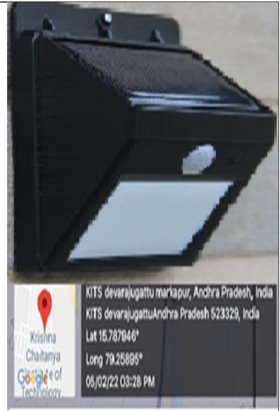
Figure 6 Solar panel with sensor light

PRINCIPAL KRISHNA CHAITANYA INSTITUTE OF TECHNOLOGY & SCIENCES Devarajugattu (Village) Peddaraveedu Mdl, Prakasam Dt, A.P.