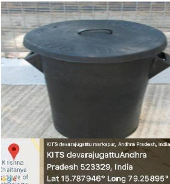
Figure 7 E- waste bin

PRINCIPAL ARISHNA CHAITANYA INSTITUTE OF TECHNOLOGY & SCIENCES Devarajugattu (Village) addaraveedu Mdl, Prakasam Dt, A.P.