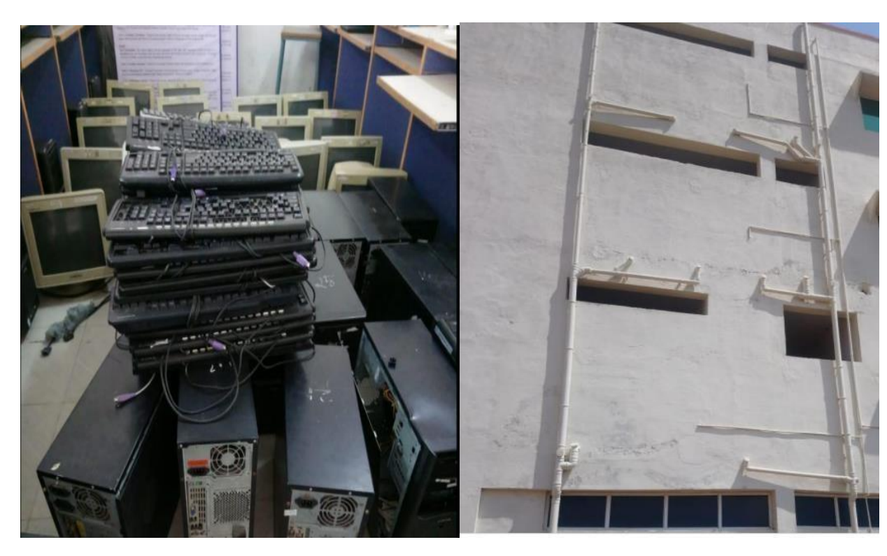
Figure 8 E- waste consolidation for recycling