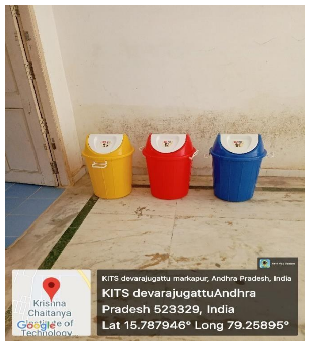
Figure 2 Colored bins usage for different types of waste