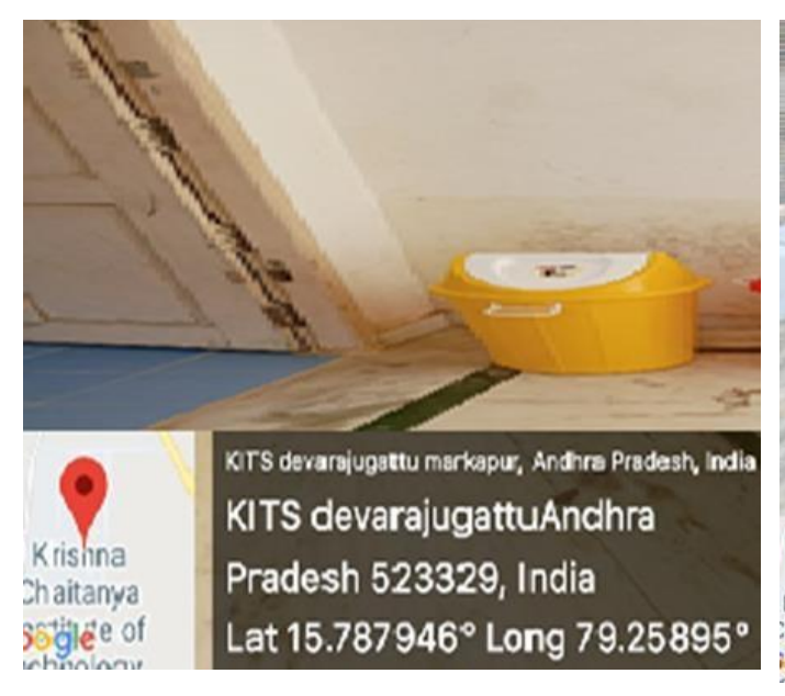
Figure 6 Sanitary waste bin