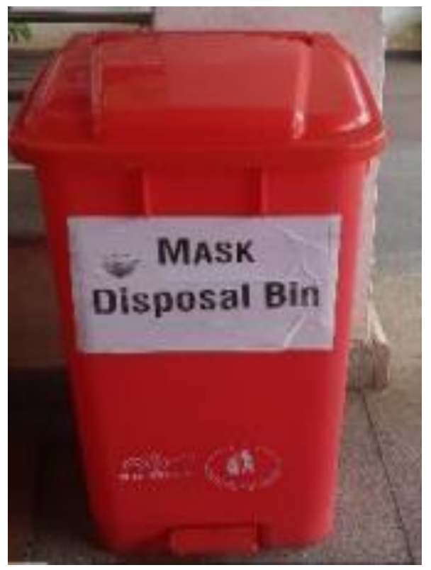
Figure 5 Mask disposal bin