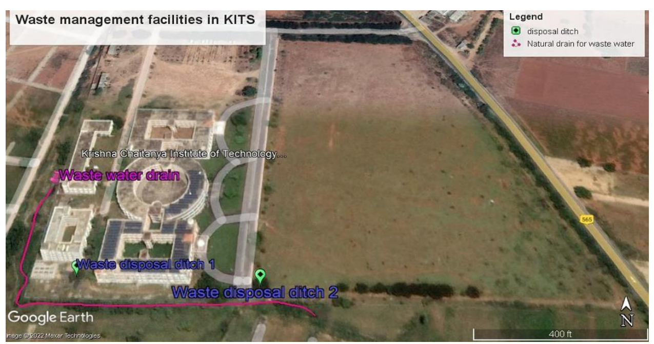
Figure 1 Solid waste liquid waste management facility on campus