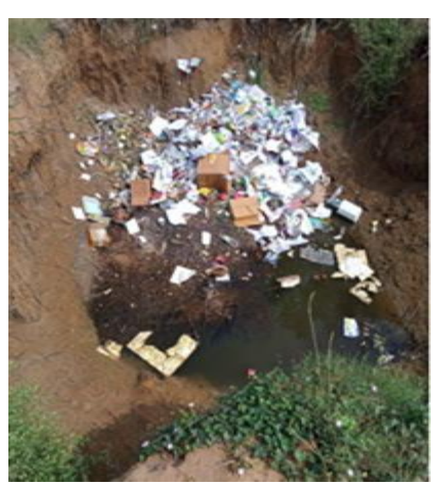
Figure 3 Waste disposal ditch

PRINCIPAL. RISHNA CHAITANYA INSTITUTE OF TECHNOLOGY & SCIENCES Devarajugattu (Village) Peddaraveedu Mdl, Prakasam Dt, A.P.