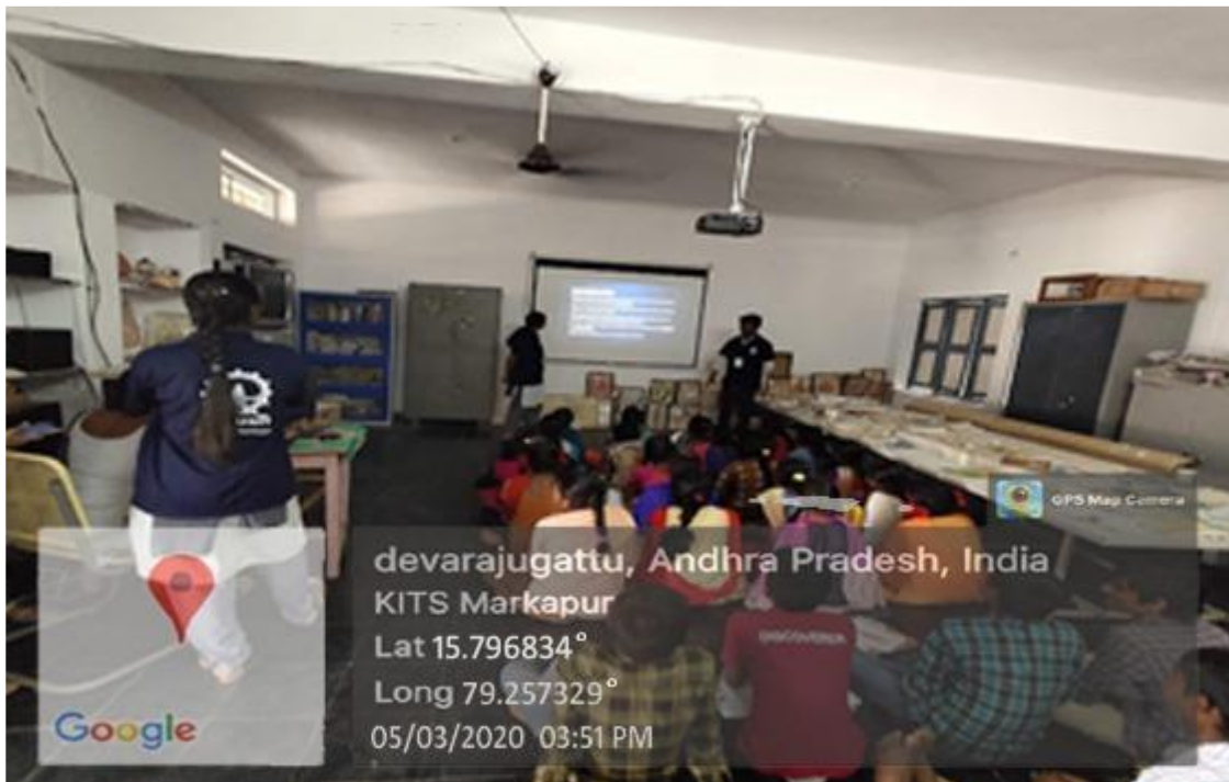
Students Giving Presentation To Children's About Digital Awareness On 5/4/2020