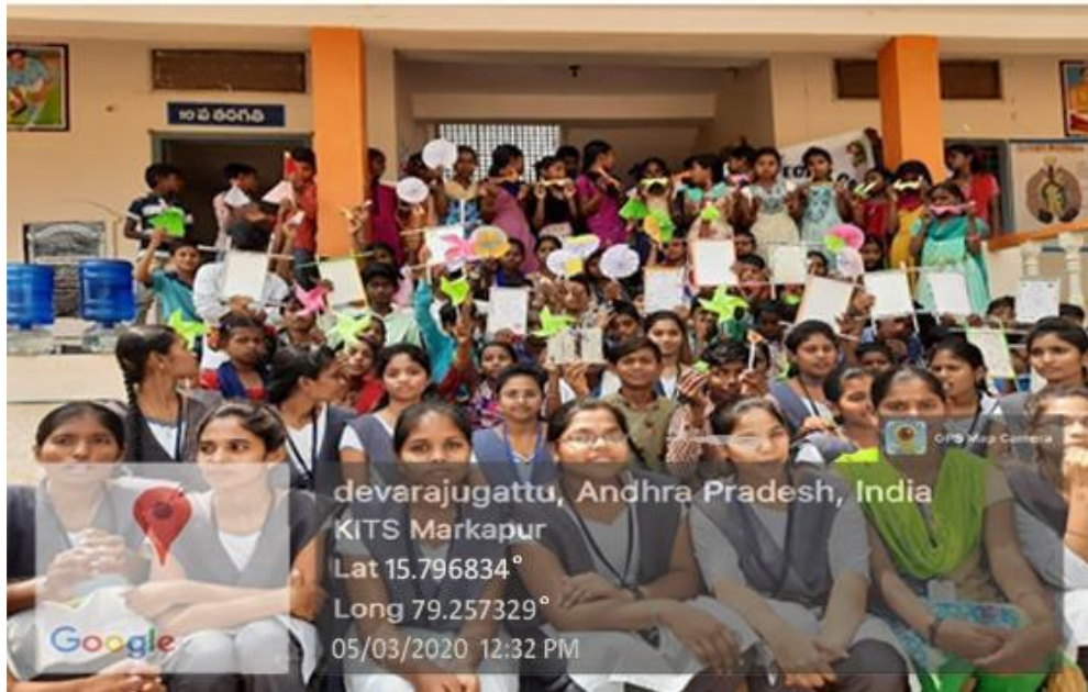
Educating School Students In Paper Crafting & They Made Above 100 Models On 5/3/2020