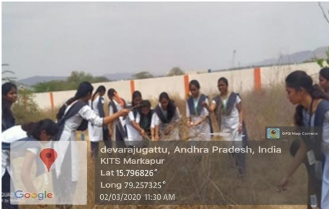
Students Participated In Swatch School Program On 03/03/2020