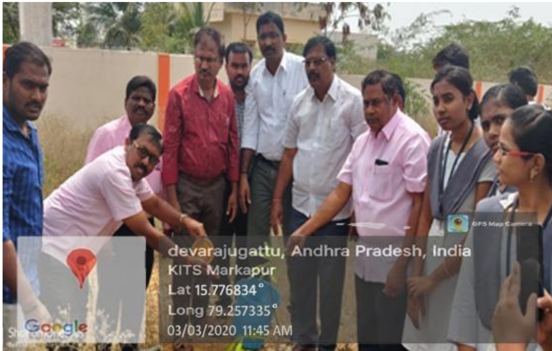
Plantation By School H.M, P.S And Staff, Students Of KITS On 04/03/2020