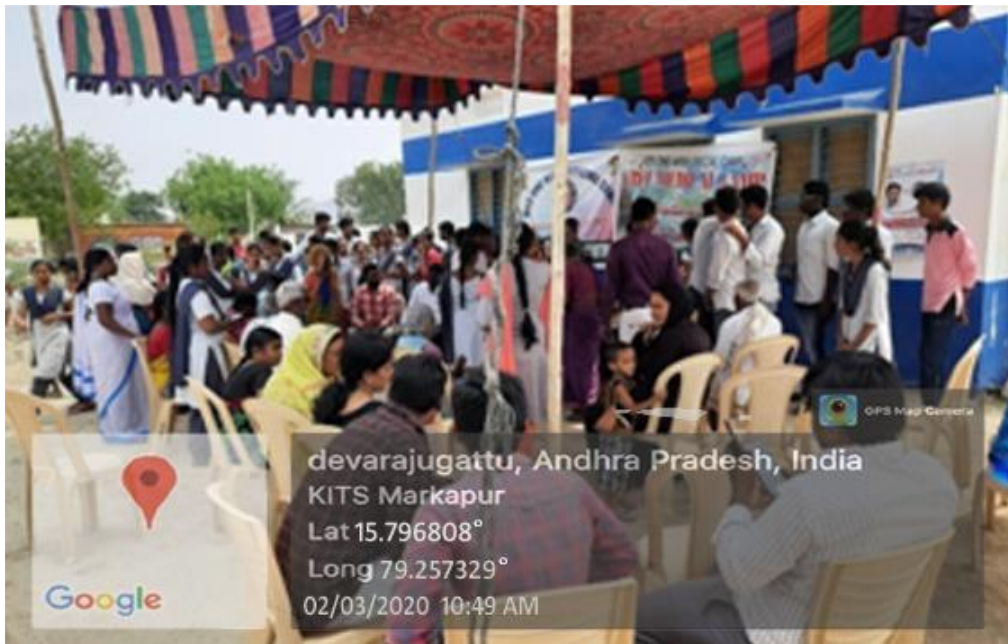
Village People & Students Participated In Free Medical Camp On 02/03/2020