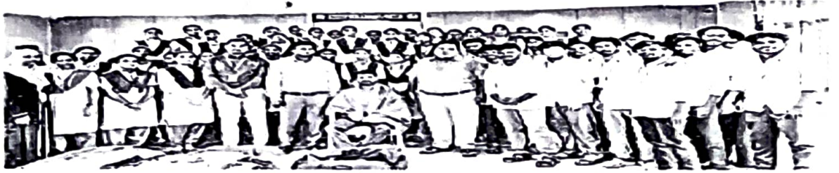
పాల్గొన్న కిద్ద విద్యార్థులు, సిబ్బంది